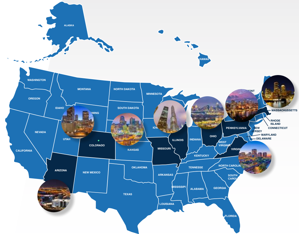
Iron Mountain Data Center presence in North America

Renewable power is widely accessible in Phoenix, helping to decarbonize customer data center operations. However, there is always more that can be done, such as sharing carbon credits with customers to encourage a greener grid, reducing embodied impact through Asset Lifecycle Management, and achieving 24/7 Carbon Free Energy.